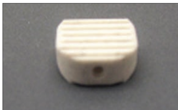
Fig. 1. Photographs showing the porous hydroxyapatite bone fusion spacer used for cervical interbody fusion; Bongros-HA™ (BioAlpha, Seongnam, Korea) has a property of rectangular shape with a threaded design that prevent dislodgement of graft and maximize bony contact surface of graft.

Cervical plain X-ray, CT scan and MRI were obtained in all patients preoperatively and postoperatively. The follow-up period ranged from 12 months to 22 months with a mean of 17 months. We evaluated the bone fusion rate. All patients were followed for a mean of postoperative 3, 6, 12 months using serial anteroposterior and lateral plain radiographs. Lateral flexion-extension radiography and cervical CT scan were obtained at postoperative 12 month to evaluate bone fusion state, intervertebral disc height, and the degree of lordosis. A rigid external orthosis was applied postoperatively for 2 months and bone fusion rate was examined by two radiologists. The authors proposed a 6-point scoring system as an indicator to confirm the bone